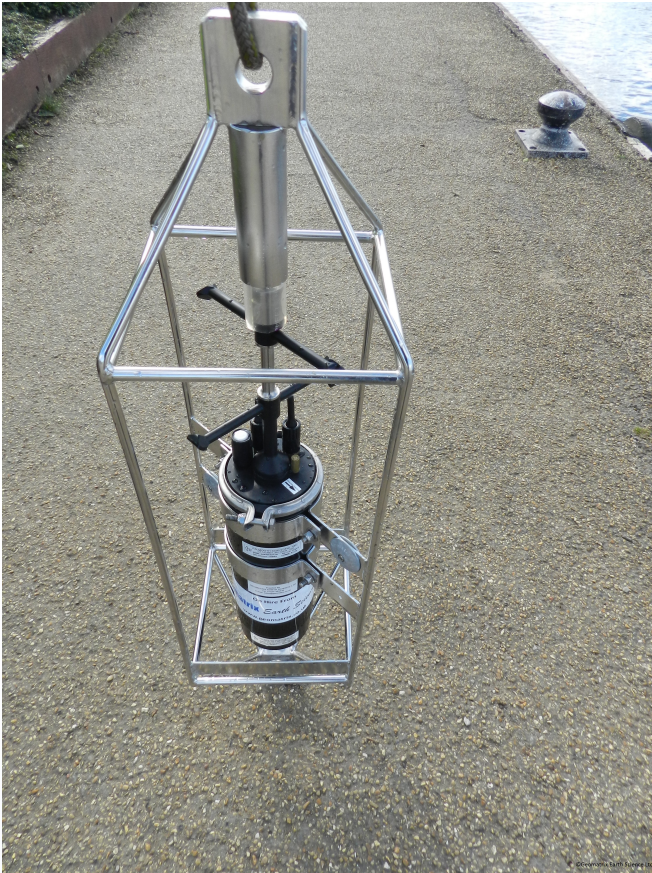
ACM Wave Plus look at CTD and auxiliary port bulk head.