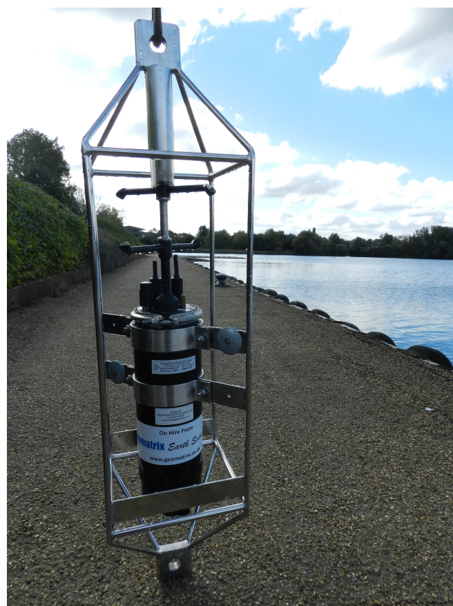
ACM Wave Plus with CTD, auxiliary port and 15 ton frame.