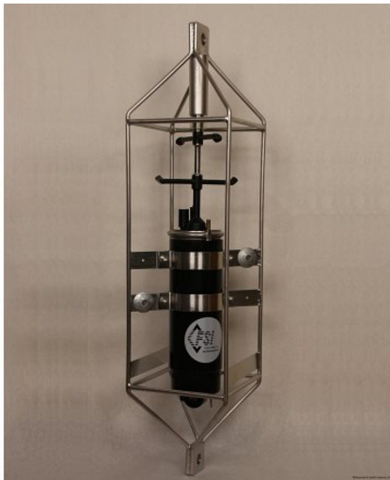
ACM-WAVE-PLUS with current, temperature and depth sensor.

The ACM-WAVE-PLUS collects, outputs and stores instantaneous current velocity data in three dimensions along with 3-axis compass data, 2-axis tilt data, temperature data and data on wave statistics and tides. The device can also be configured to log up to two auxiliary inputs from external sensors (e.g. pH, Fluorometer, Transmissometer) and can be equipped with an optional CTD module.