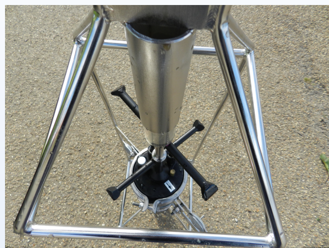
ACM Wave Plus CTD,