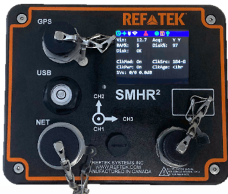
Fig 1 - Image of the SMRH 2 Integrated Seismic Recorder and Accelerometer depicting the ports and data screen, includes 3 adjustable feet for levelling.

The SMRH 2 is a new integrated seismic monitoring system which combines the broadband seismic recorder with the 147-force balance accelerometer, enclosed in a single unit (Fig.1).