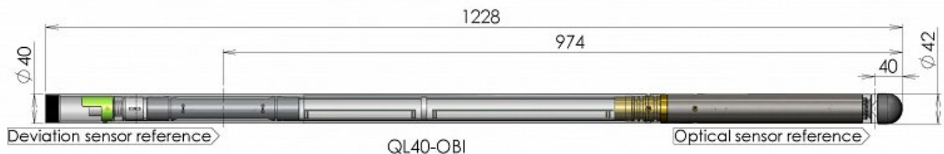
Schematic drawing of QL40-OBI.

The QL40-OBI tool is supplied as a bottom sub of the Quick Link (QL) product line. It can either be combined with other QL40 tools to form a tool string or it can be run as a stand-alone tool. The OBI40 is the standalone- non stackable- version.