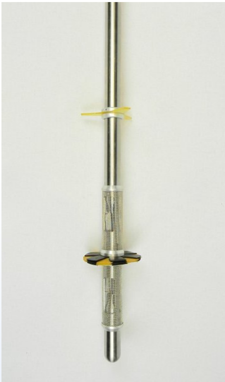
Heat pulse flow meter fitted with centralisers and deviation collar.

Heat Pulse flowmeter probes are used to measure water movement up and down the borehole from which fracture-specific flow intervals and rates can be derived. The unique design permits low flow rates to be resolved.