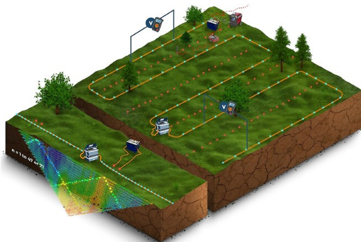
Fig. 1. 2D and 3d array capability - Image shows from left to right the different arrays of the system 2D (increase survey depth from electrode 1 to 48 whilst keeping resolution) to 3D (connect 48 to 16000 electrodes combing injection and reception dipoles in all

Similar to the Syscal systems, the Elrec Terra is available in standard or switch mode (48 to 120 electrodes) and the standard Electre pro can be used together with a number of switch terra systems for a larger configuration (e.g. Connect two Electre terra switch in master-slave mode to > n.o electrodes 48ch becomes a 96ch system) increasing the system scalability (Fig. 1). If required, the system has a built-in test function which with the provided test equipment, can be used to check the system whilst in the field, allowing more efficient use. Any datafiles can be downloaded onto a USB drive or via WIFI connection to a smartphone or tablet, if shipping the unit, the LI batteries can be removed for ease of transport.