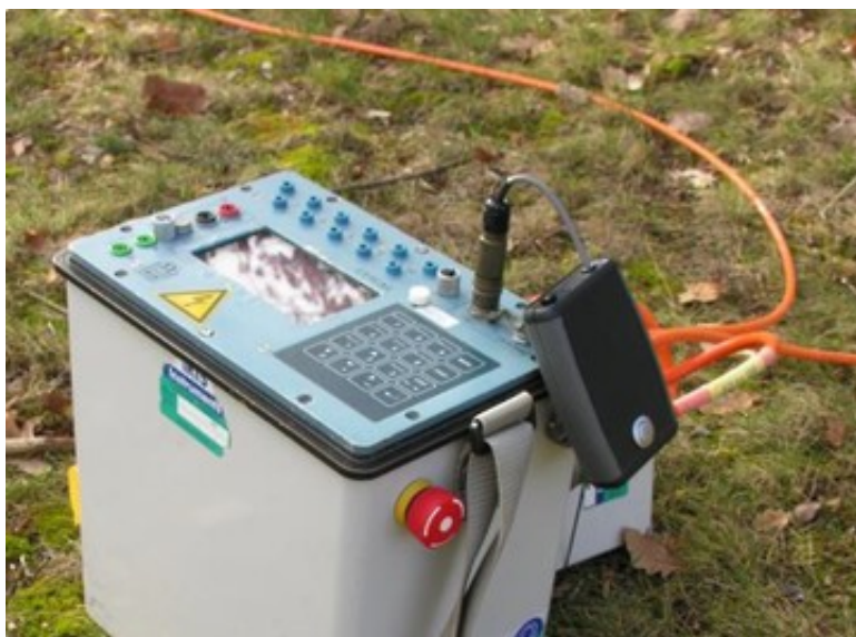
Syscal WiConnect connect to a Syscal Pro.

The WiConnect device allows a wireless connection from your tablet, smartphone or laptop. Perform a Rs-Check, choose your sequence and start, stop, pause the acquisition or check the data quality from the comfort of any shelter located around your Syscal/Elrec. With the WiConnect device, download automatically your data. Save it to your cloud server or email it to your office for faster reporting. The WiConnect device allow to control and download data from a webpage and can be used from any platform (Windows, Android, Apple, Linux) and any device featuring a Wi-Fi connection.