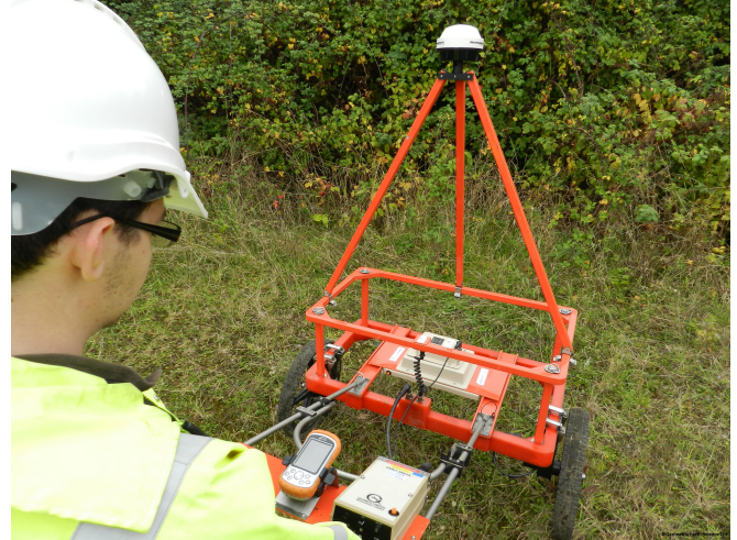
EM61MK2 set-up for typical brown field site.