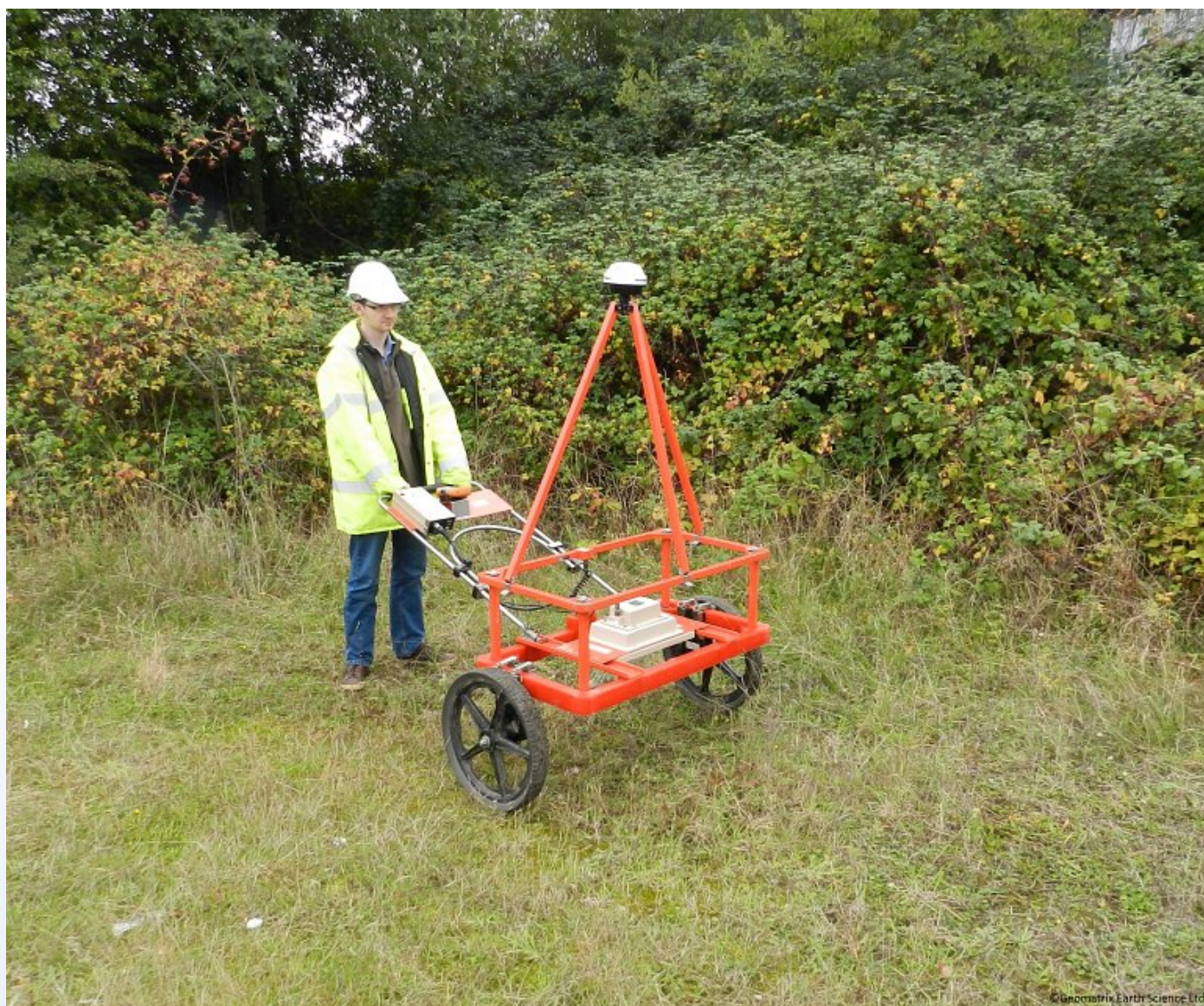
EM61MK2 with GPS integrated.

Data from multiple time gates - three or four, user selectable - are recorded to provide a more complete measurement of the response decay rate for improved target characterisation (and discrimination). Early time gates improve the detection of smaller, as well as deeper targets; a mid-range time gate, at the same position as the original EM-61, offers comparison with, and continuation of original EM-61 data sets.