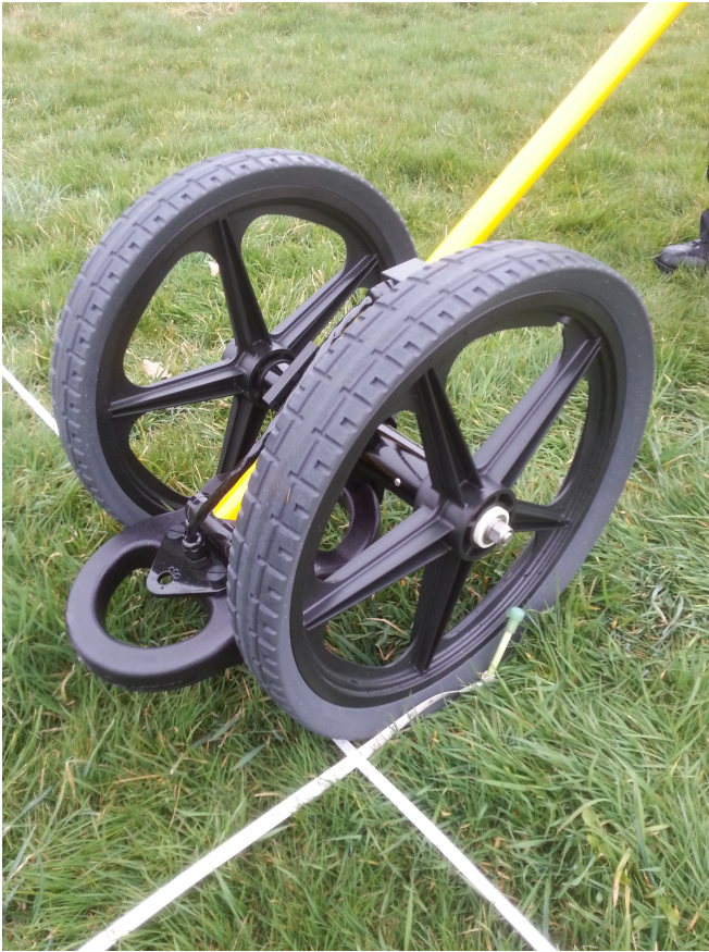
EM61MK2 HH coil