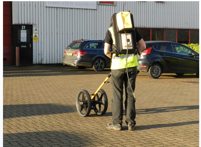
EM61HH MK2 surveying urban site.