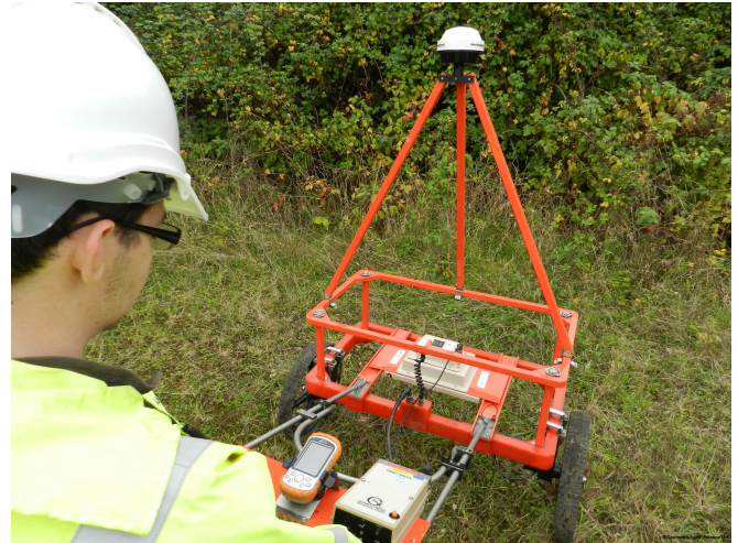
EM61MK2 set-up for typical brown field site.