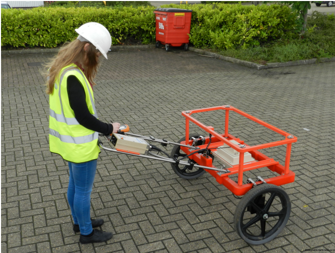
EM61MK2 set-up for typical urban buried tank mitigation survey.