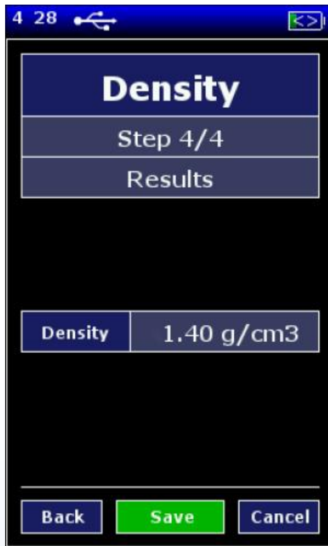
KT20 density measurement_screen shot.