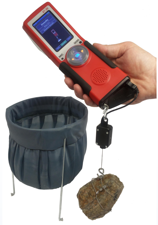
KT20 density measurement- first the sample is weighed in air.