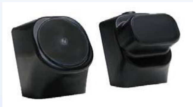
KT20 Circular and Square sensors.