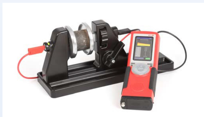
KT20 density measurement- then in water, the density is determined through Archimedes principle.