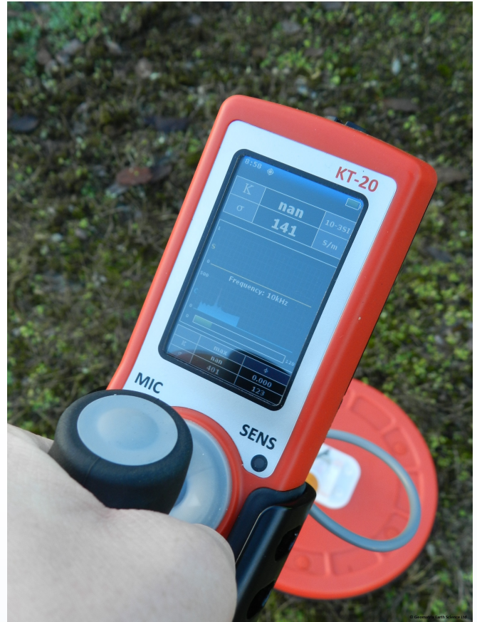
3F 32 Scan mode