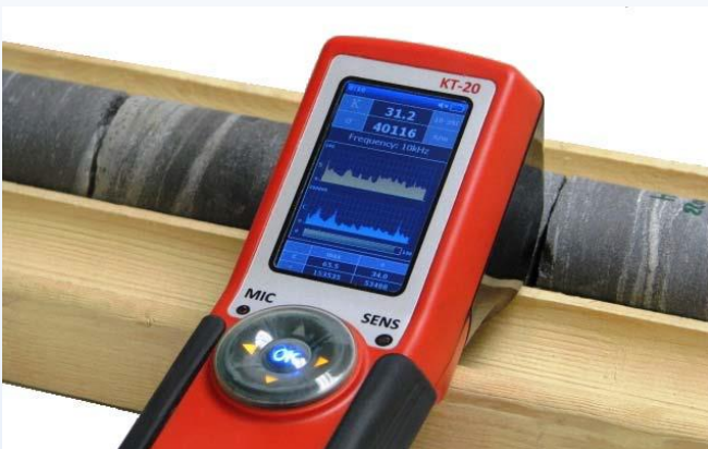
KT20 measuring a core profile.