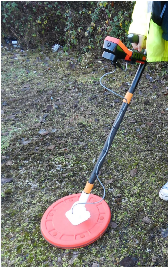
KT 20 3F 32 field loop