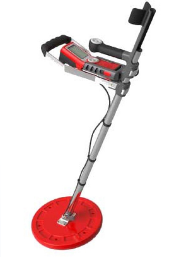
KT20 deployed with 3F-32 ground coil. Ideal for agriculture, archaeology, and environmental investigations.