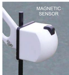
All the main components of a PROMIS system, Image courtesy of Iris Instruments.