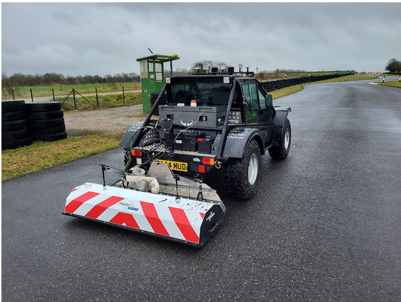
Fig 1. Shows the features of the vehicle carrier and how it fixes onto a survey vehicle

The raptor series are a set of High speed GPR systems which use real time sampling (RTS) technology to obtain accurate and fast results in a variety of applications. The Vehicle carrier option (Fig.1) allows the operator to choose between a 18 channel arrangement for the 450MHz antenna up to an 28 channel array for the 800MHz antenna. The robust design of the raptor vehicle array, allows the user to fix the carrier to survey vehicles with ease, allowing fast data collection in regulated traffic flows. Once the survey is finished the carrier can be easily stored in the back of your vehicle and transported for use on a number of project sites.