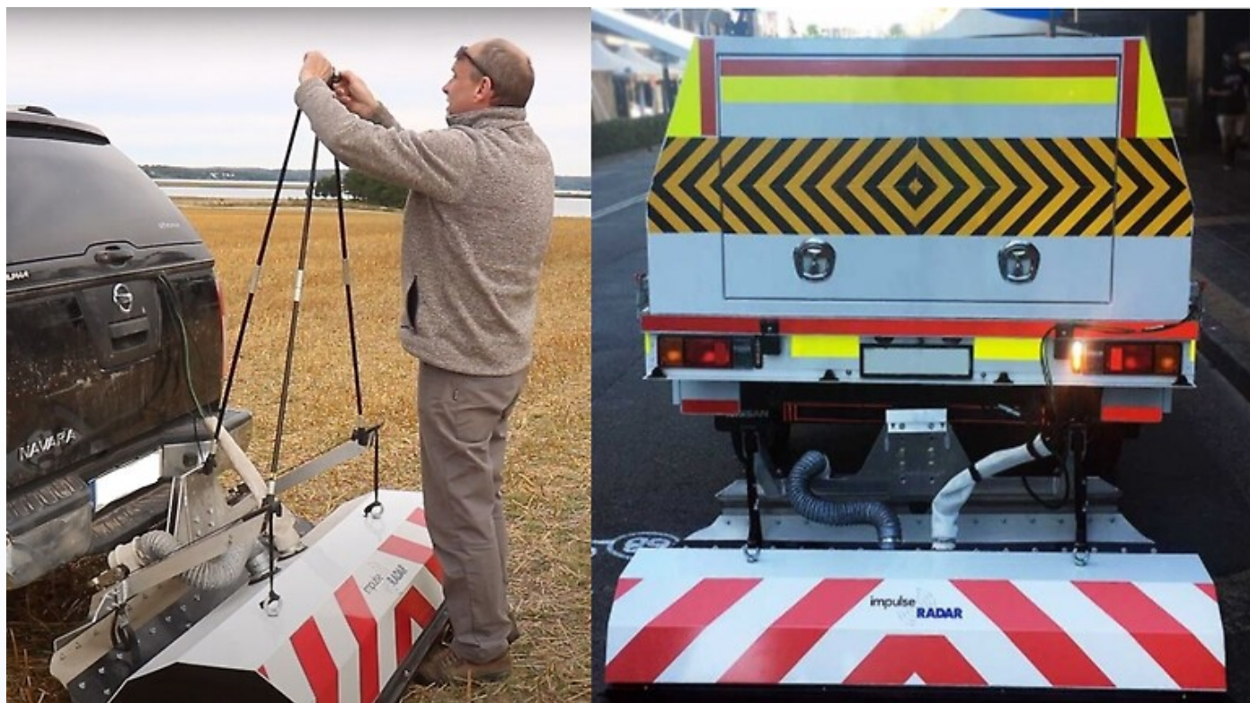
Fig 1. Shows the features of the vehicle carrier and how it fixes onto a survey vehicle

The raptor series are a set of High speed GPR systems which use real time sampling (RTS) technology to obtain accurate and fast results in a variety of applications. The Vehicle carrier option (Fig.1) allows the operator to choose between a 18 channel arrangement for the 450MHz antenna up to an 28 channel array for the 800MHz antenna. The robust design of the raptor vehicle array, allows the user to fix the carrier to survey vehicles with ease, allowing fast data collection in regulated traffic flows. Once the survey is finished the carrier can be easily stored in the back of your vehicle and transported for use on a number of project sites.