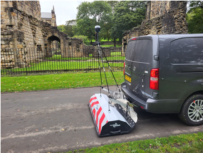
Raptor at Kirstal Abby, Leeds, Yorkshire