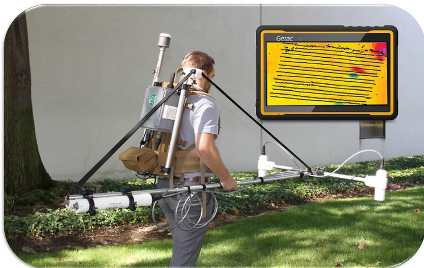
Geometrics G-864 horizontal gradiometer with DGPS receiver

The high performance G-864 caesium magnetometer/gradiometer provides a quick and efficient solution for magnetic mapping. It gives extremely accurate magnetic field readings at a high sample rate (10Hz). Data is passed via Wifi to a rugged tablet with a head up navigation display. A a USB memory stick installed on the backpack electronics module record the raw magnetic measurements and GNSS position to ensure the users data is always backed up. The tablet has the speakers removed for reduced magnetic influence, and can be used to operate the system within 1m of the sensors with minimal noise using the NavMag app.