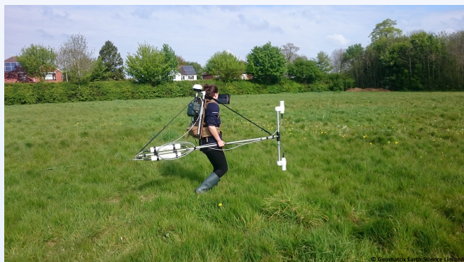
Using MagMonitor in navigation mode to complete a survey