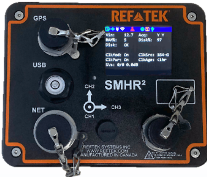
Fig 1 - Image of the SMRH 2 Integrated Seismic Recorder and Accelerometer depicting the ports and data screen, includes 3 adjustable feet for levelling.

The SMRH 2 is a new integrated seismic monitoring system which combines the broadband seismic recorder with the 147-force balance accelerometer, enclosed in a single unit (Fig.1).