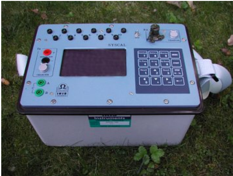
Syscal Pro Deep Marine console

In fresh water environments the standard Syscal Pro can be used for marine resistivity profiling however in highly conductive environments the instruments a modified variant with higher current output is required.