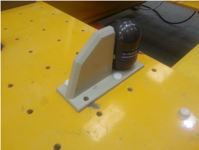
Tritech iGC mounted on the GEEP multi sensor platform.