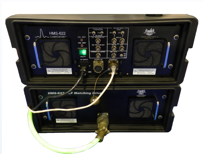
Top end power supply and Analogue A/D electronics module. The secondary module is only required for Low Frequency and Ultra Low Frequency transducers.