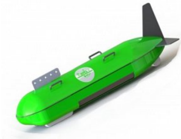
LF and HF Tow Vehicle

Sub-bottom profiling applications in diverse sediments require multiple frequency bands to support diverse survey requirements. The HMS-622 CHIRPceiver and transducer arrays and vehicles fill this wide range of survey needs.