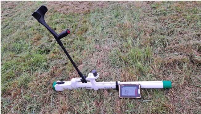
MagEx with carry handle and Getac tablet